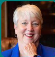
Becky Haas Community Track